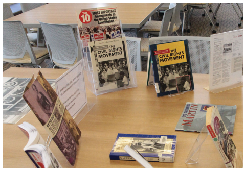
Curriculum Materials Center