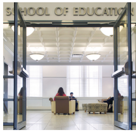
Old Main, Main Entrance